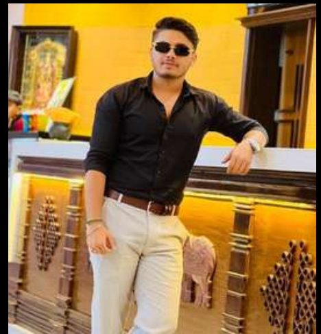
RAVISH ADMINISTRATION HEAD