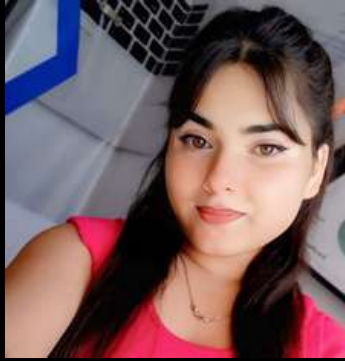
MANSI ADMINISTRATION HEAD