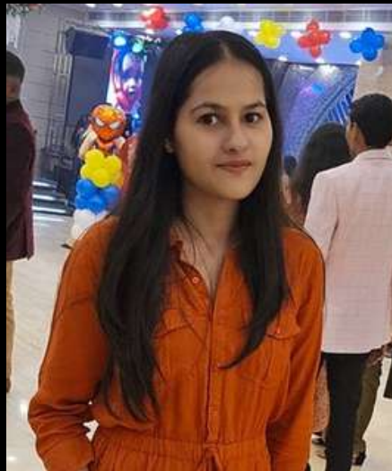
KHUSHI HR HEAD