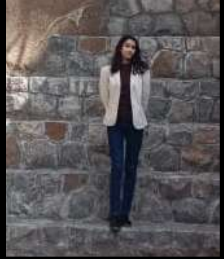
KAJAL IT HEAD