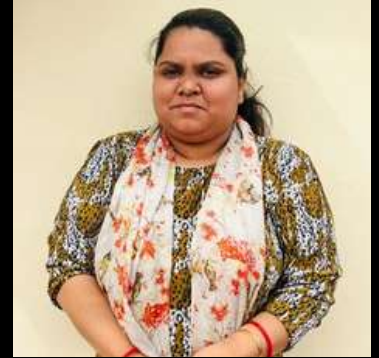
SAKSHI MANAGING EXECUTIVE